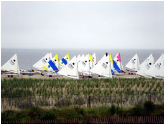
Above: THE START: on Page #2: THE LUNCH BOAT